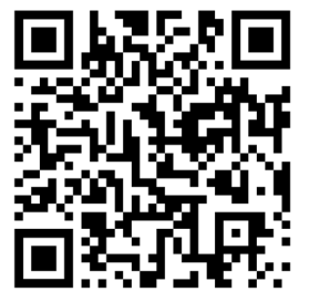
SCAN to sign up for school store shift

The Hitching Post is open Monday-Friday after school from 2:15-3:15 p.m. so students can grab a snack, pick up supplies and purchase spirit wear. Visit: https://www.signupgenius.com/go/60b054daaad2ba1f94-hitching#/ to schedule a shift once/week, once/month or whenever works for you. The Hitching Post will also have additional popup sales during select school events including Freshman Orientation, Back to School Night, select Football games, Homecoming and more.